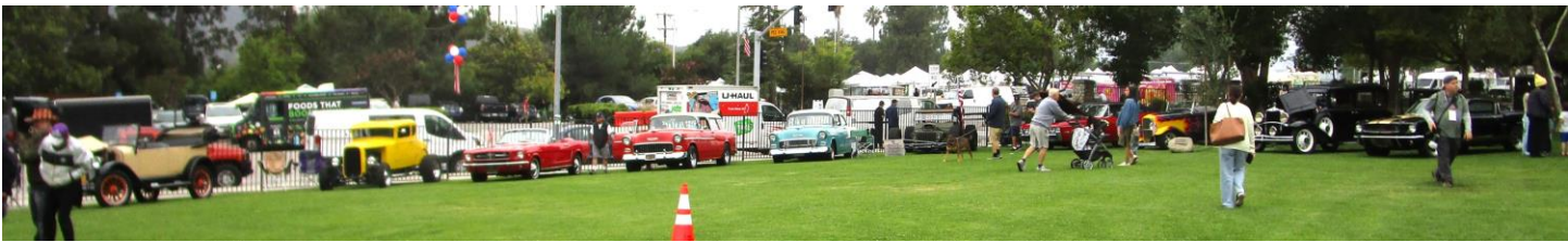
And another picture showing more of the participants beautiful cars that were near the fence