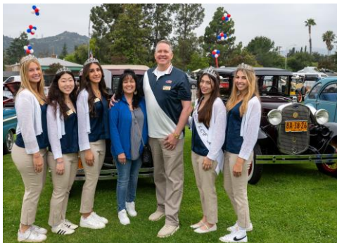
Theodore along with the Royal court