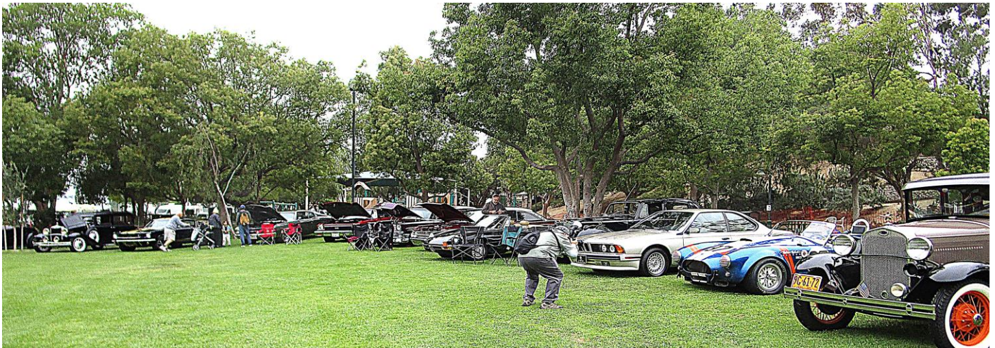
In this picture we have some of the other cars that participated in the event