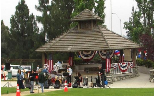
<< For entertainment there was a live band set up in front of The pagoda that played during the entire event.