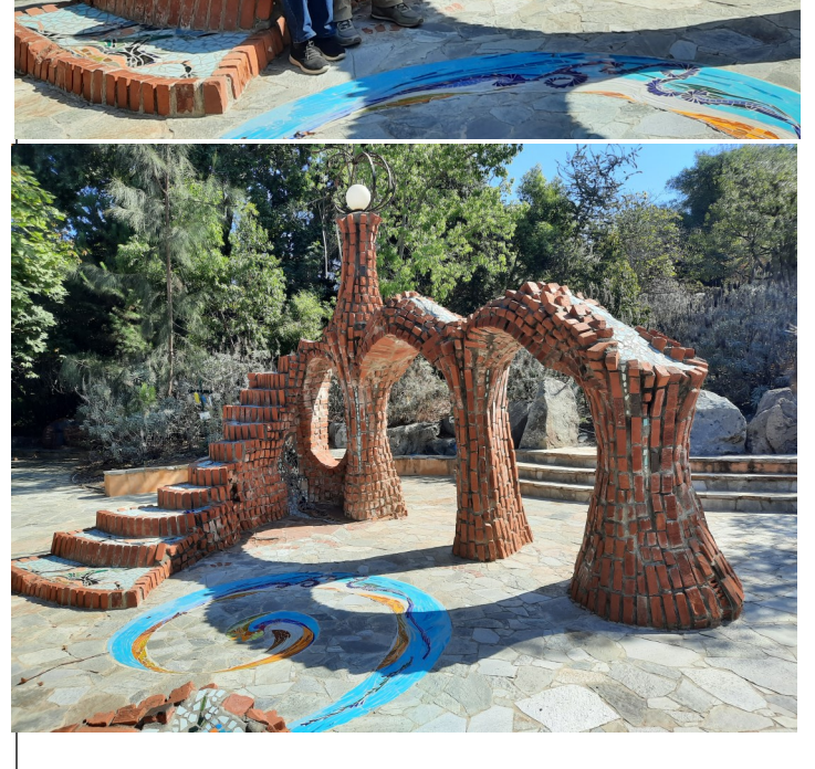
(Continued on page 4)