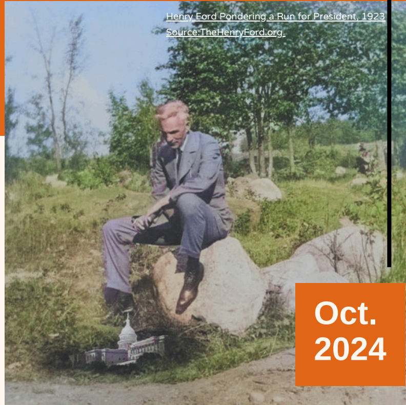
Henry Ford Pondering a Run for President, 1923