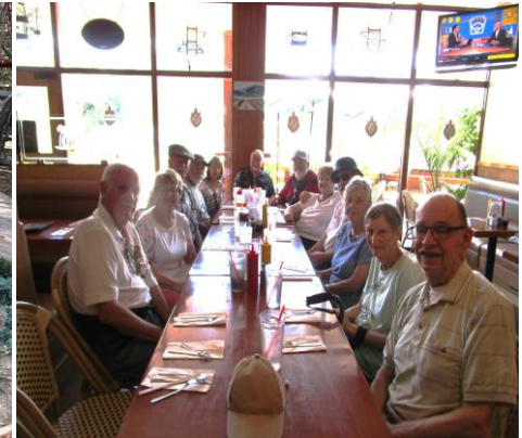
Lunch at the North Shore Burger

As per usual, our tours somehow wind down at some eatery in the immediate vicinity. Since we were in the area of Montrose, we decided on going to North Shore Burgers, where they do offer more than just burgers.