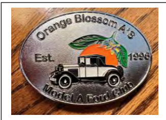
Car Badge (metal) for radiator $25.00