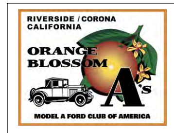
One Pair of Magnetic Signs for Cars = $20 per set