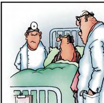
"You've got to start sometime. Why not operate on this one?"

Instead of a sign that says, "Do not disturb" I need one that says, "Already disturbed, Proceed with caution"