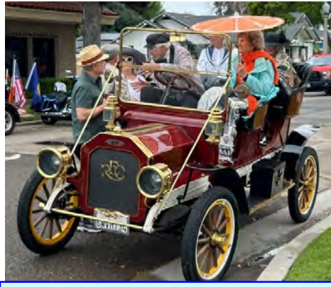
Reo Motor Car, from John Wayne's movie, "Big Jake"