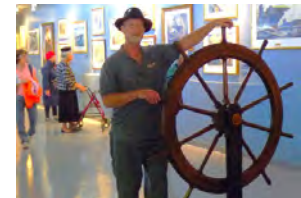
Yours truly looking very much in command.