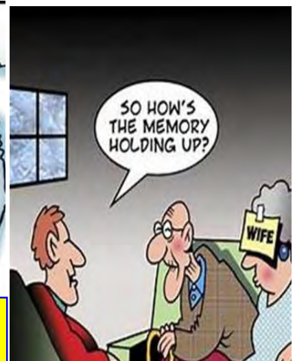
SO HOW'S THE MEMORY HOLDING UP?