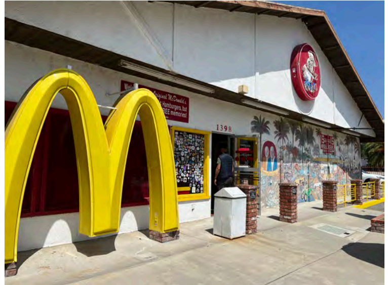
Lots of good information, McDonald's collectibles, and Inland military history at the OBA tour to the museums in San Bernardino. Below is a pic of all of the Model As that made the trek. Congrats to all the OBAs who participated!