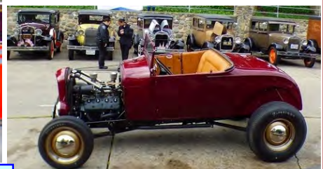
Cutaway engine that actually runs, showing all the workings