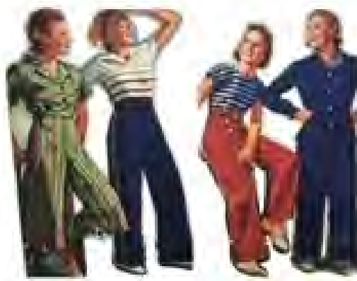
Springing Into Summer