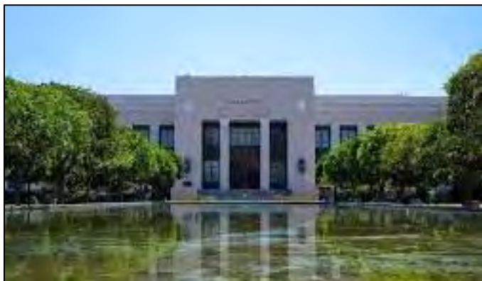
Pasadena City College

A number of technical seminars for the high school Model A Ford Club have been conducted at PCC. The instructors there volunteer their time to open the automotive shop on a Saturday morning to enable the activity. One of the seminars was held there on Saturday November 16, 2019. The subject was the assembly of an overhauled Model A Ford transmission and bell housing that were installed in a Model A Ford the club later raffled off.