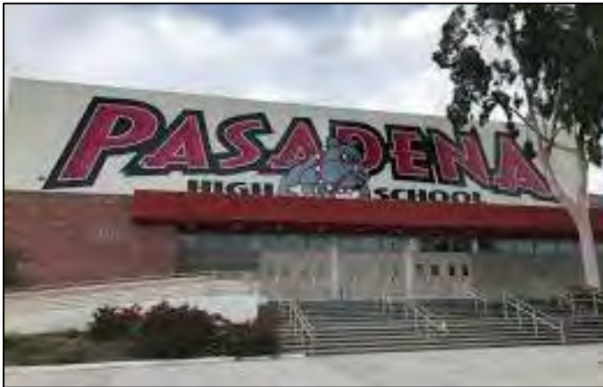
Pasadena High School