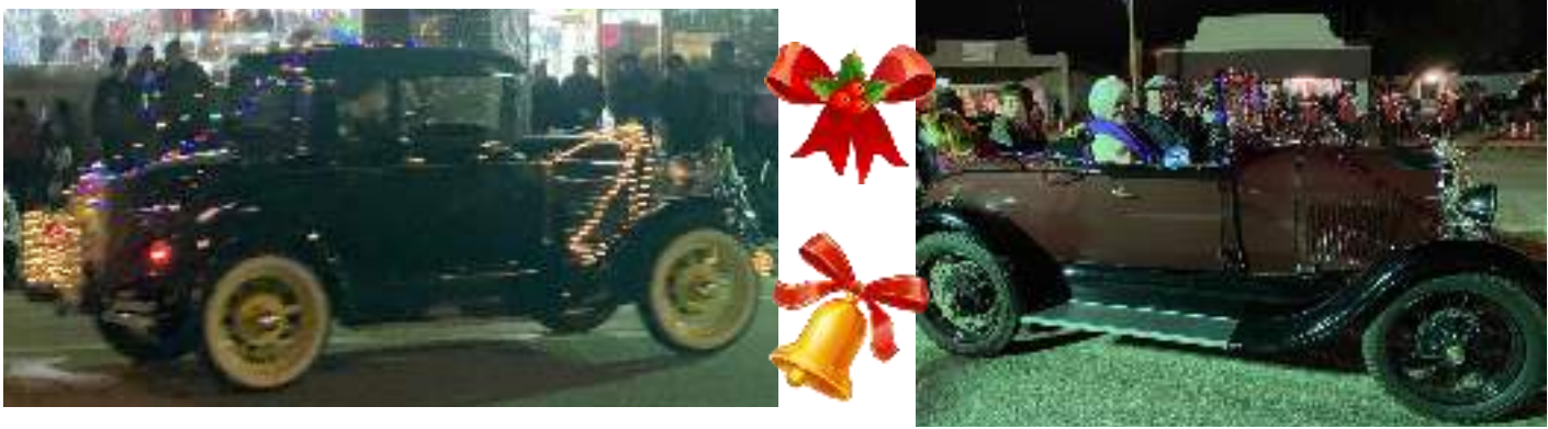
Nice lights on the Georgi Family car