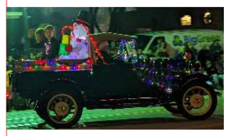
A light load of Penniman Grandkids and Snowman