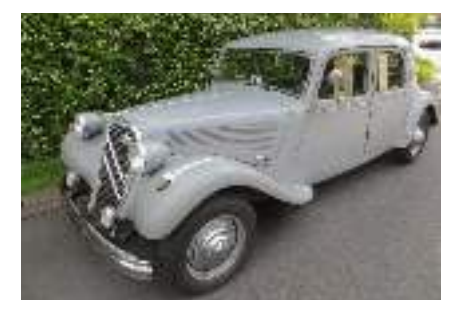
Citroen Traction IIB (1953)