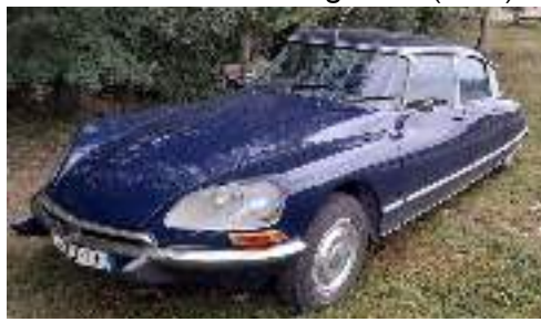
a Citroen DS 21 IE (1970).