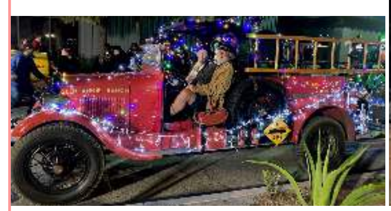
Fred & Cyndy with enough lights for a firetruck