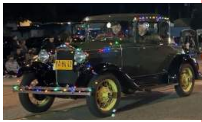
Don Lauer and guest all lights and smiles