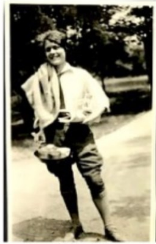
Figure 4: late 1920s, lady camping

Camping with portable campers, pulled behind an automobile, became popular after the turn of the century. Ladies took to wearing knickers and jodhpurs for ease of movement and modesty as they camped, cooked and hiked across the country. These could be made of wool tweed, half wool tweed, cotton tweed, corduroy, whipcord, linen, or khaki. "Practically all the world wears the Knicker nowadays": Montgomery Ward and Co. Spring and Summer 1928.