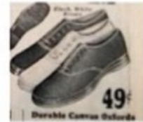
Figure 6: Montgomery Ward 1931

In pictures of the Model A era, you will see lots of ladies in tall leather boots. Red Wing introduced their first ladies' hiking boot, the Gloria, in 1926, complete with a 'compact pocket' to keep your powder compact safe. Pictured is one of the original ads for the same boot. Red Wing is reintroducing this boot as part of their Heritage Collection and can be purchased today. Also available were canvas shoes similar to today's Keds. In the 1931 Montgomery Ward's catalogue, they are available in brown, black or white canvas.