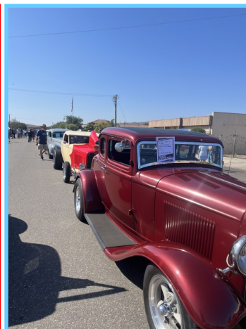
Fords on display at the show