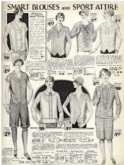
Figure 5: Charles Williams Stores, 1928