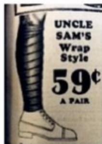
Figure 7: Sears, Roebuck and Co., Fall and Winter 1931-32

Wool or leather leggings, known as puttees, were used and had been since WWI by the American and Allied troops. Originals are getting harder to come by, but reproduction puttees are still available. Puttees could be used with short boots or oxford style shoes. Pictured is an ad referencing