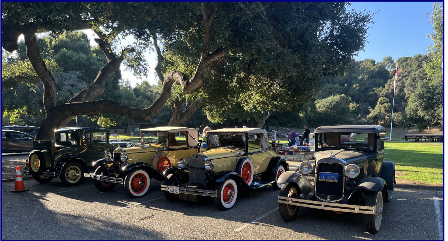
Some of our Model A's parked under the beautiful oaks at Tucker's Grove