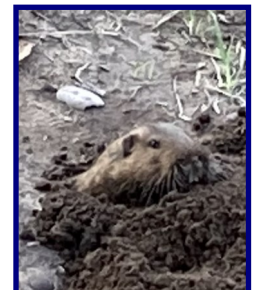
A curious Mr. Gopher