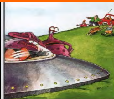
Well, here they come...You locked the keys inside, you do the talkin'