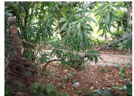
The "V" fence