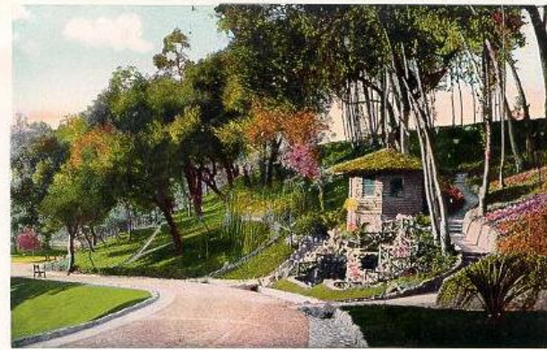
Oak Drive and Mystic Hut.

One of the popular features in the lower garden was the "Mystic Hut" , which stood behind a series of stone-lined pools. The hut is gone, but you can still see its foundation, along with the stone-lined pools, on the north side of Busch Garden Drive.