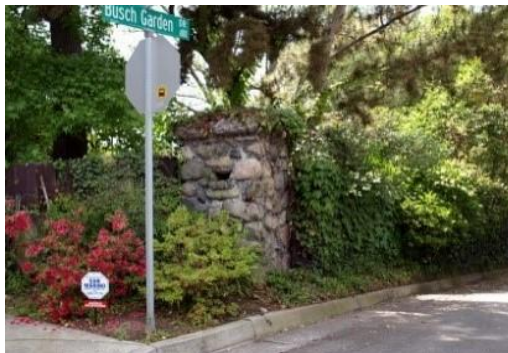
The ticket Booth

Here's one remaining element of the entrance to the park's lower garden. The ticket booth stood across the street to the right: 25 cents for adults and 10 cents for children. You needed to buy an addition admission to visit the upper gardens across Arroyo - but all the money went to support injured war veterans in the community.